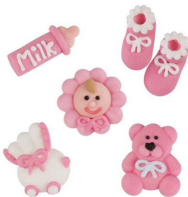
Z0423 Pink Sugar Christening Set 96 Pack Box