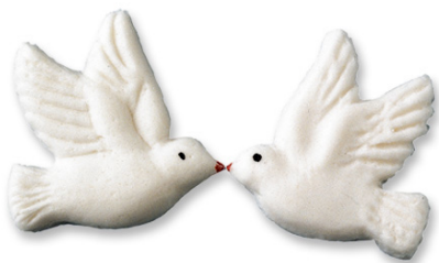
Z0482 White Sugar Doves 84 Pack Box