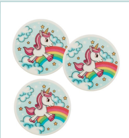
Z0437 Unicorn Decor Plaque 90mm 12 Pack Box