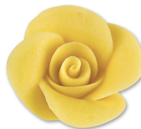
Z0448 Small Yellow Marzipan Roses 48 Pack Box