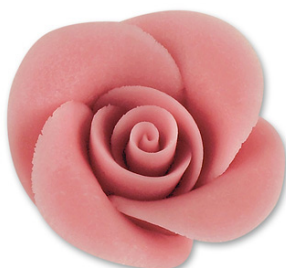
Z0449 Small Pink Marzipan Roses 48 Pack Box