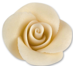
Z0446 Small White Marzipan Roses 48 Pack Box