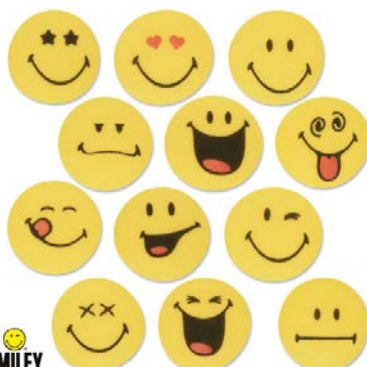
Z0433 Yellow Sugar Smileys 120 Pack Box