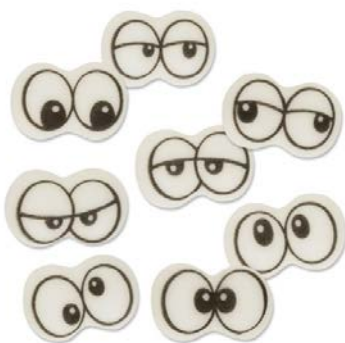
Z0432 Assorted Sugar Eyes 48 Pack Box