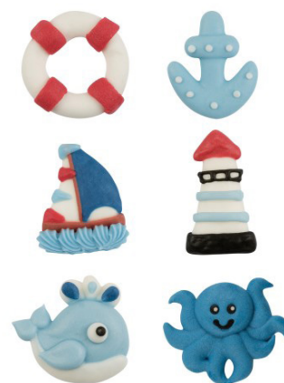
Z0445 Assorted Sugar Sea Shapes Flat 72 Pack Box