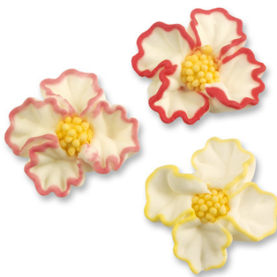
Z0435 Assorted Sugar Flowers 96 Pack Box