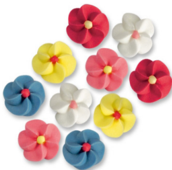
Z0483 Small Assorted Sugar Flowers 500 Pack Box