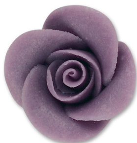
Z0450 Small Lilac Marzipan Roses 48 Pack Box