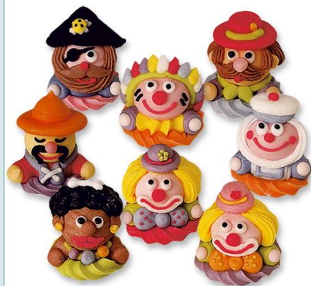
Z0424 Carnival Faces Assorted 80 Pack Box