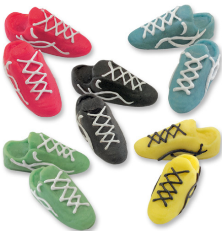
Z0426 Marzipan Football Boots 20 Pack Box