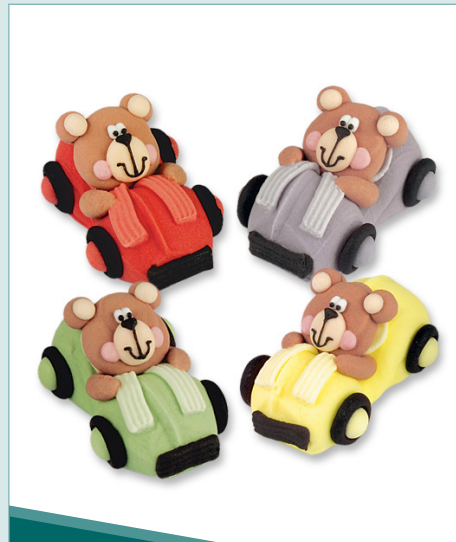
Z0430 Sugar Bears 48 Pack Box