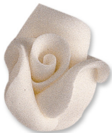
Z0451 Small White Tragacanth Sugar Roses 24 Pack Box