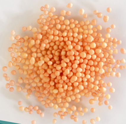
Z0487 Orange Non Pareilles 2kg Bucket