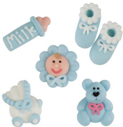
Z0422 Blue Sugar Christening Set 96 Pack Box