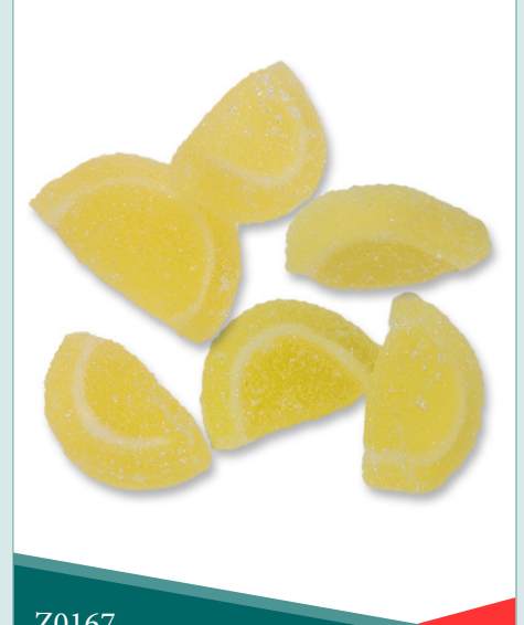
Z0167 Lemon Jelly Fruit Slices 1kg Pack Box