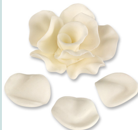
Z0455 White Fine Sugar Roses with Leaves 33 Pack Box