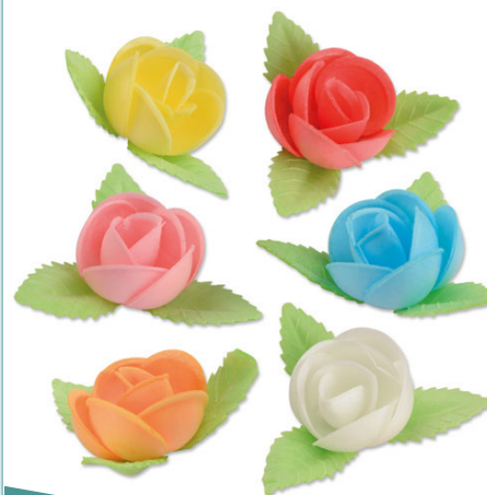
Z0484 Wafer Flowers With Large Leaf 80 Pack Box