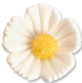
Z0434 Med White Tragacanth Sugar Flower 96 Pack Box