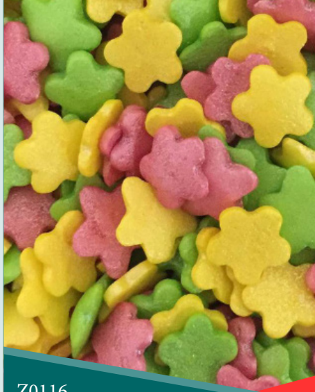
Z0116 Glimmer Flowers Spring Mix 800g Pack Bag