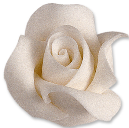
Z0453 Large White Tragacanth Sugar Roses 12 Pack Box