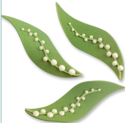
Z0454 Lily of the Valley Tragacanth Sugar 48 Pack Box