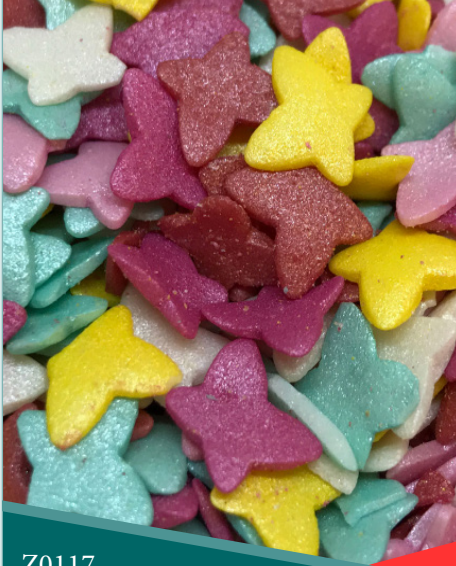
Z0117 Glimmer Butterflies Multicoloured 800g Pack Bag