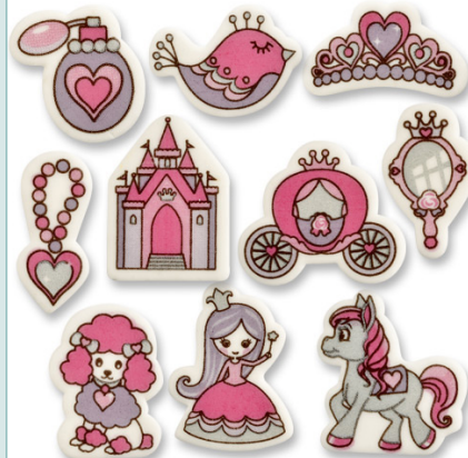
Z0443 Assorted Little Princesses Sugar 100 Pack Box