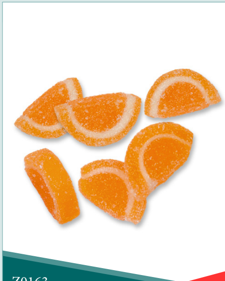
Z0163 Mandarin Orange Jelly Fruit Slices 1kg Pack Box