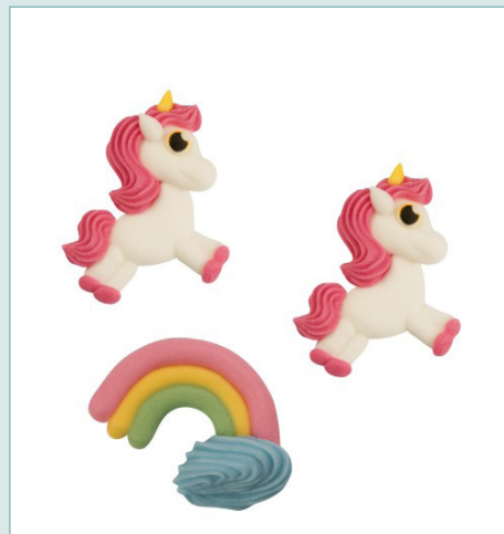
Z0444 Unicorn Sugar Set 72 Pack Box