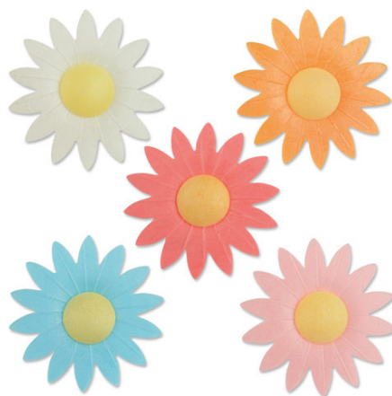
Z0428 Assorted Wafer Marguerites 100 Pack Box