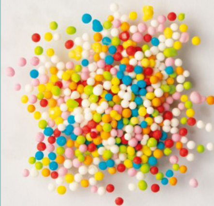
Z0485 Non Pareilles 2kg Bucket