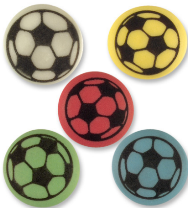
Z0441 Sugar Footballs 180 Pack Box