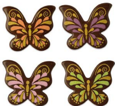
Z0486 Assorted Dark Chocolate Butterflies 112 Pack Box