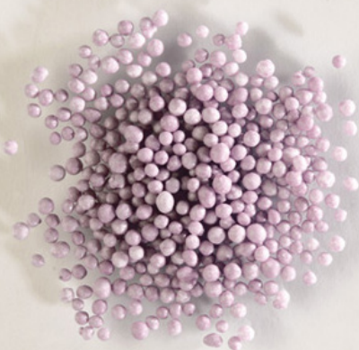
Z0488 Lilac Non Pareilles 2kg Bucket