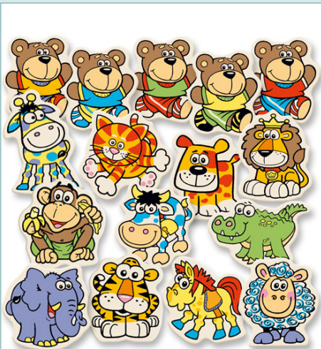
Z0442 Sugar Animals 100 Pack Box