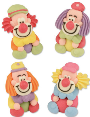
Z0427 Assorted Sitting Sugar Clowns 48 Pack Box