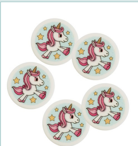
Z0436 Unicorn Decor Plaque 40mm 100 Pack Box