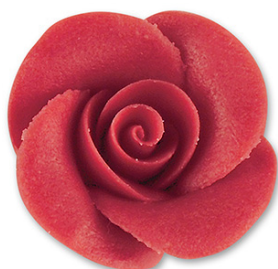
Z0447 Small Red Marzipan Roses 48 Pack Box