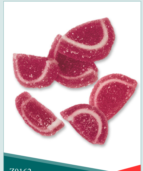
Z0162 Fruit of the Forest Jelly Slices 1kg Pack Box