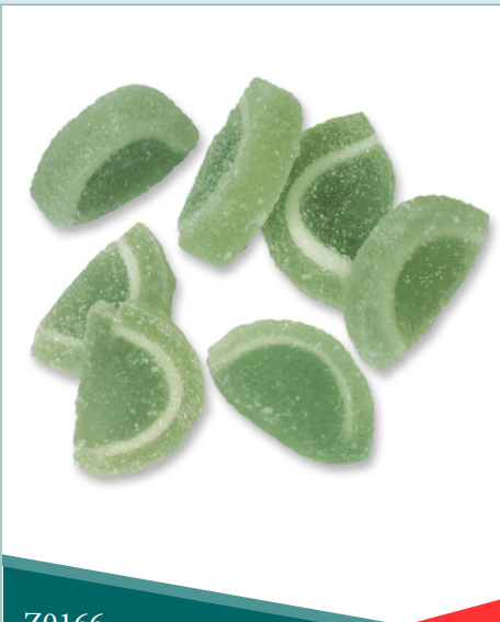
Z0166 Kiwi-Lime Jelly Fruit Slices 1kg Pack Box