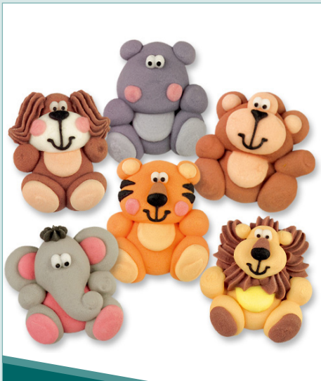
Z0431 Sugar Animals Figures Flat 48 Pack Box